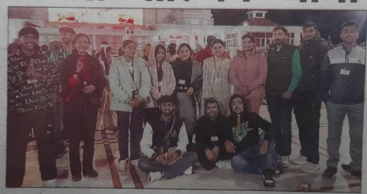
ऊना : वैष्णो देवी के पवित्र मंदिर की आध्यात्मिक यात्रा के दौरान इंडस यूनिवर्सिटी के विद्यार्थी।

वैष्णो देवी जैसे प्रतिष्ठित धार्मिक स्थलों की यात्रा की सुविधा प्रदान